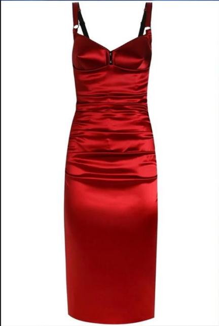
Object integration / extraction | E-Commerce oriented imagery