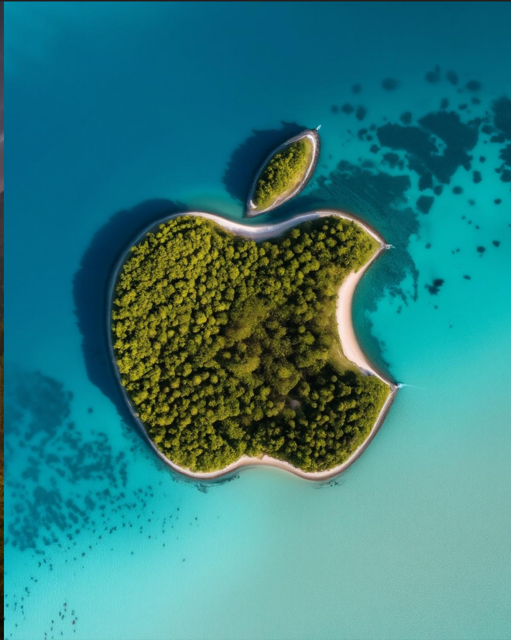
ControlNet | Dictates the shape of the generation. These were made by SDXL + ControlNet + Flux + Photoshop