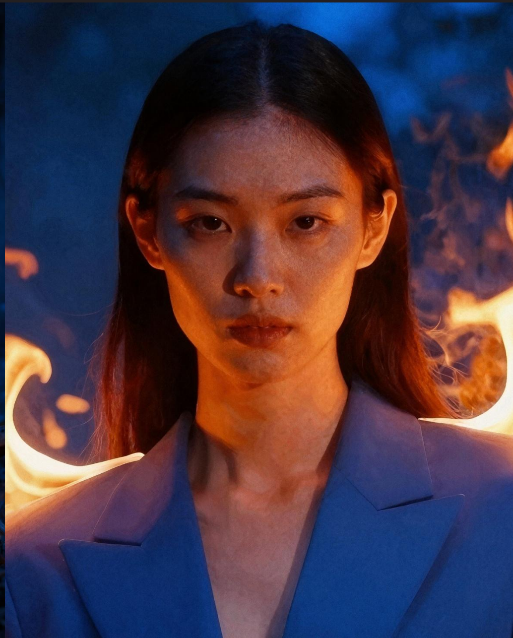
Detailed Upscaling | Adding details in the process. This example is 11.000px width, preserving the quality.